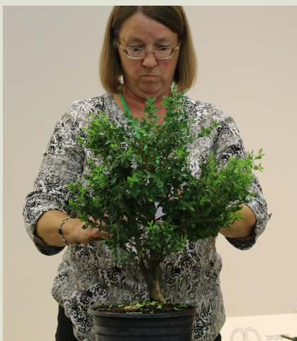
progress and consulting