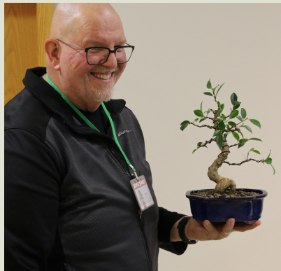
Pleased with finished Ficus