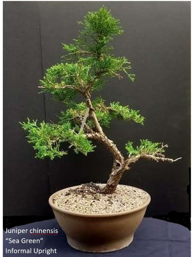
Juniper chinensis "Sea Green" Informal Upright

Tim's May-2019 Annual Show demo tree, showing the development by Sep-2019