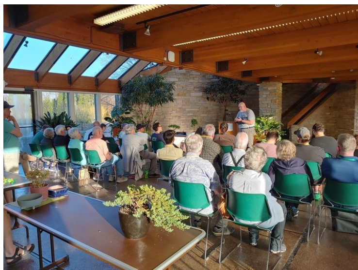
It was a packed house for the April meeting