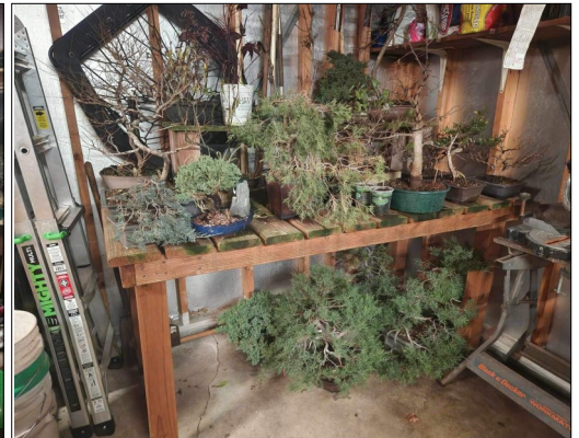
Zach's unheated garage set up doesn't leave room for cars, but he can probably squeeze in a few more bonsai.