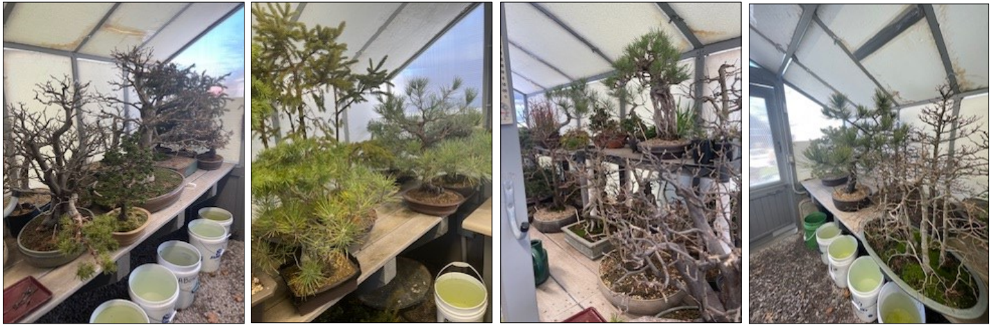
Ron's temperate trees are tucked into the greenhouse for the winter. He installs insulation as a solar block to keep the temperatures at or near 30-35 degrees. Here they'll be protected from winds, widely varying temperatures, and any animals looking for a snack. His tropicals are in the basement inside an enclosure where they'll have plenty of light and humidity.