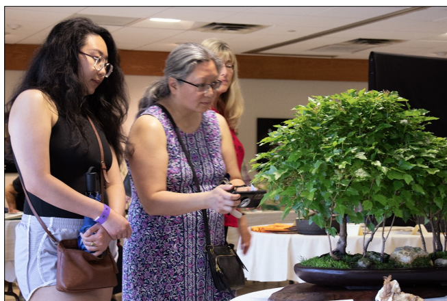
Recording the details.