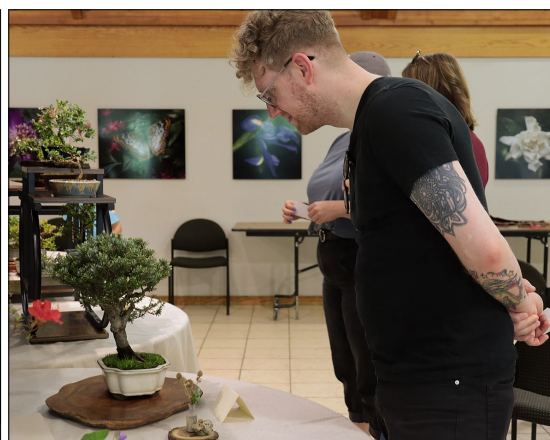
Staring the tree down.