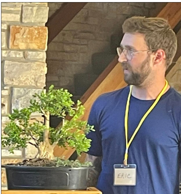
Eric - boxwood