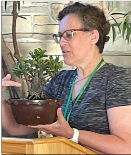
Sharon - Ixora, a tropical