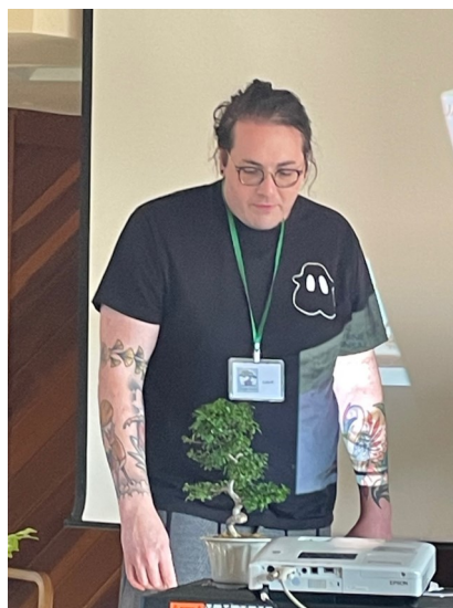
Colin showed off an adorable Japanese spindle tree dressed in pink berries and a Ken To pot.