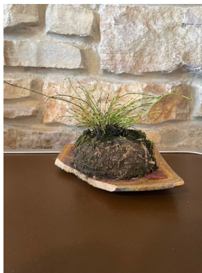
Skyler's recent acquisition, a dwarf horsetail reed, will make for a lovely accent plan