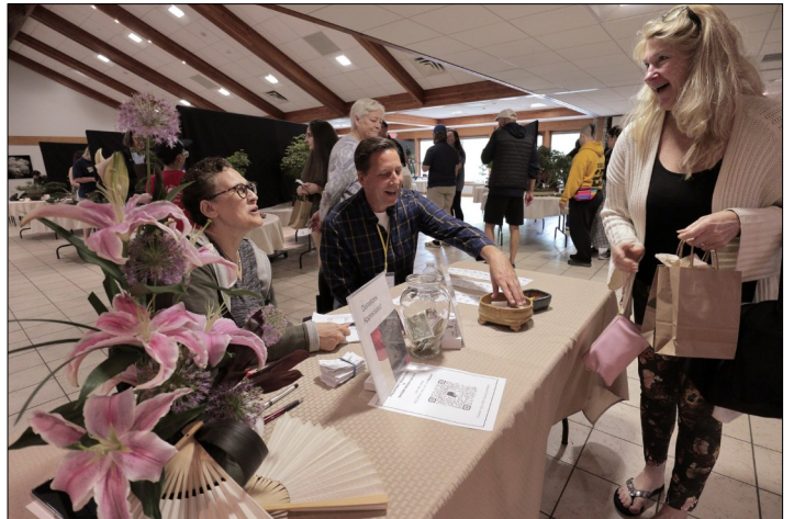
The cordial welcome