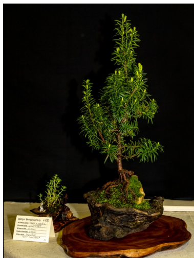
#38, Hybrid Yew, 9 years, root over rock informal upright