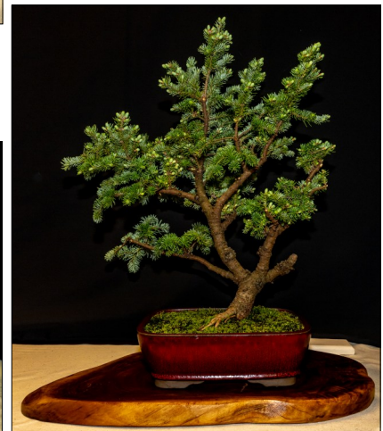
#9, Dwarf Balsam Fir, 20 years,