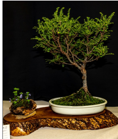
#37, Chinese Elm, 9 years, informal upright, 20 years, slant style

The trees for auction are pictured with the show card number, common name, estimated age and style. Please go to our website at https://badgerbonsai.net/2025/05/30/silent-auction-for-jennifers-trees/ to see these exceptional bonsai before the meeting. Be sure to click and enlarge the pictures to appreciate the health, beauty and artistry of these trees