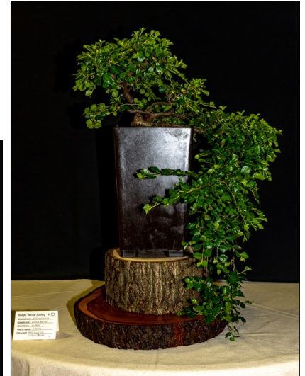
#10, Cotoneaster, 10 years, semi-cascade