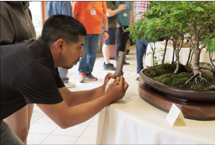
Shooting it like I'm right there