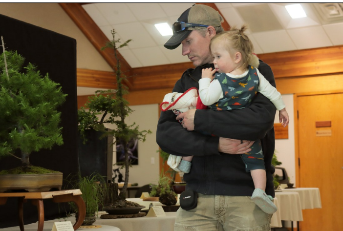
Dad with little bonsai lover