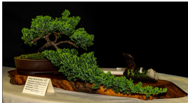
#8, Dwarf Japanese Juniper, 28 years, semi-cascade