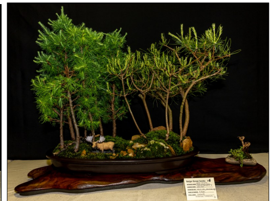
#6, Larch and Jack Pine, 6 years, miniature landscape