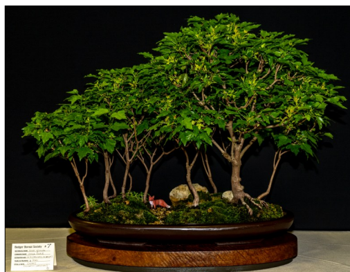
#7, Amur Maple, 10 years, miniature landscape