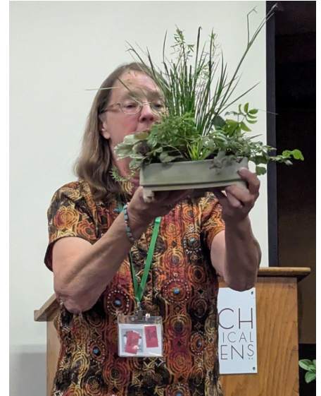
Some members brought in the kusamono they had created at the Young Choe workshops.