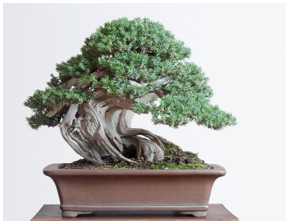
Examples of feminine and masculine style trees.