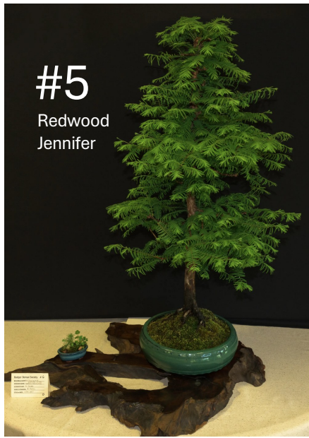
#5 Redwood Jennifer