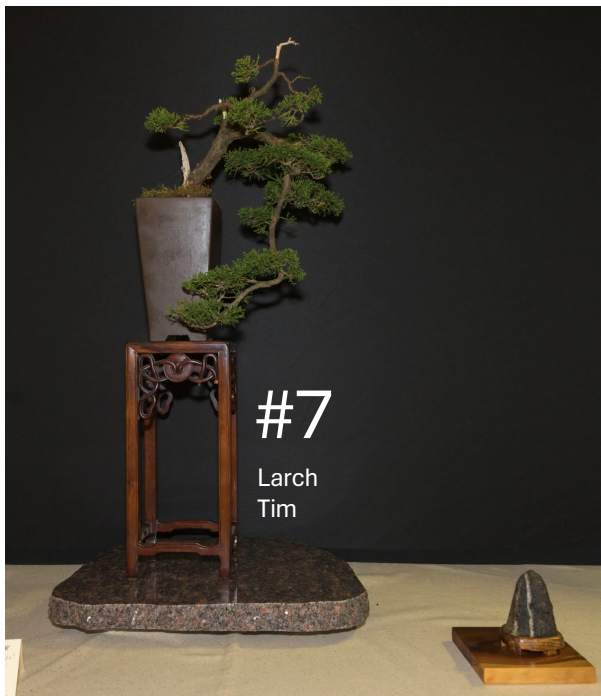
#7 Larch Tim