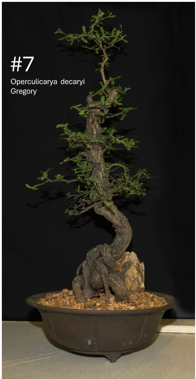
#7 Operculicarya decaryi Gregory